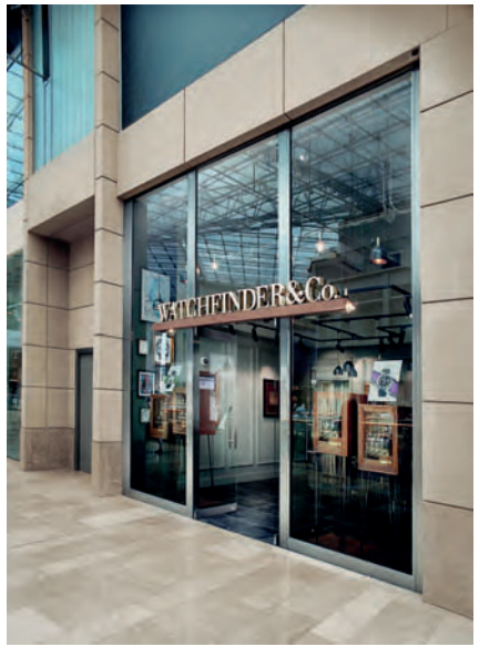
The Bullring & Grand Central boutique, Birmingham

Founded in 2002, Watchfinder buys, services and sells pre-owned watches. It is the recognised leader in this business area. Watchfinder operates both online and through its network of boutiques and showrooms, predominantly in the UK, enabling it to reach customers wherever they are through a fully integrated, omni-channel approach.