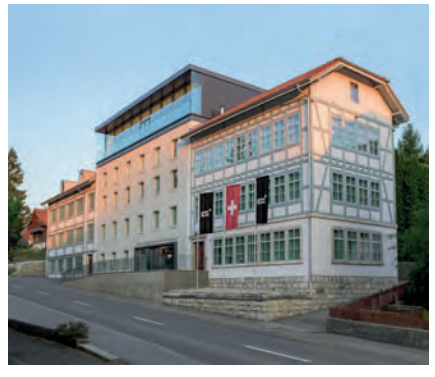
Montblanc Manufacture, Villeret, Switzerland

For over a century, Montblanc's writing instruments have been the symbol of the art of writing. Driven by its passion for craftsmanship and creativity, Montblanc provides elegant, sophisticated and innovative creations in the fields of fine watchmaking, fine leather, new technologies and accessories.