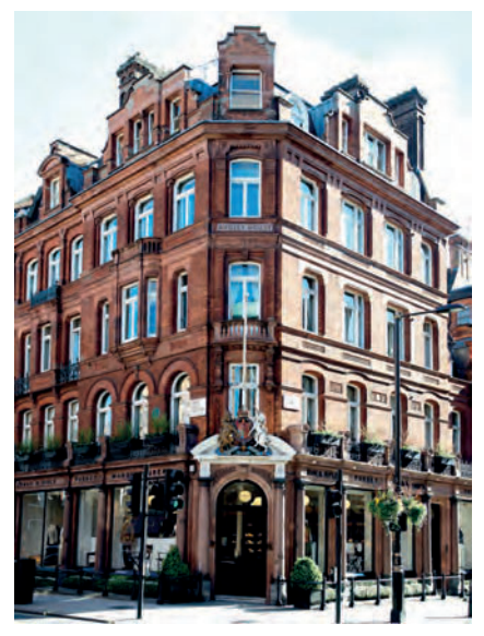
Audley House, the home of James Purdey & Sons since 1882

James Purdey & Sons, holder of three Royal Warrants as gunmakers to the British Royal Family, was founded in 1814 and has been crafting the finest shotguns and rifles for more than two centuries. The combination of precision craftsmanship and exquisite finish make Purdey guns the most desirable choice for the passionate shooter.