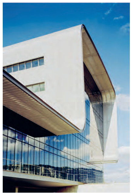
Vacheron Constantin's Manufacture and headquarters, Geneva

Crafting eternity since 1755, Vacheron Constantin is the world's oldest watch Manufacture in continuous production, faithfully perpetuating a proud heritage based on transmitting expertise through generations of master craftsmen.