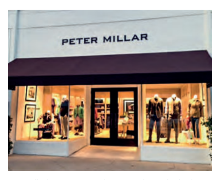
Peter Millar boutique. 313 Worth Avenue, Palm Beach, Florida

Peter Millar designs classic, luxury sportswear embracing timeless style with a modern twist. Displaying superior craftsmanship, unexpected details and the highest quality materials from the finest mills in the world, Peter Millar lifestyle apparel offers a distinctive vision of casual elegance.