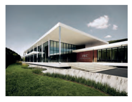
IWC Manufakturzentrum in Schaffhausen