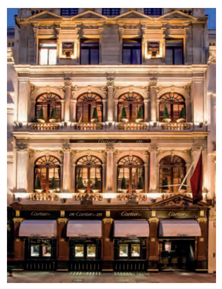
Bond Street boutique, London

Founded in 1847, Cartier is not only one of the most established names in the world of jewellery and watches, it is also the reference of true and timeless luxury. The Maison Cartier distinguishes itself by its mastery of all the unique skills and crafts used for the creation of a Cartier piece. Driven by a constant quest for excellence in design, innovation and expertise, the Maison has successfully managed over the years to stand in a unique and enviable position: that of a leader and pioneer in its field.