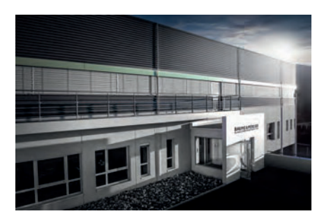
Baume & Mercier, Les Brenets

Baume & Mercier has been creating watches of the highest quality since 1830, combining performance, technical achievement and refined design. For both men and women, the Maison offers style with cutting-edge technology.