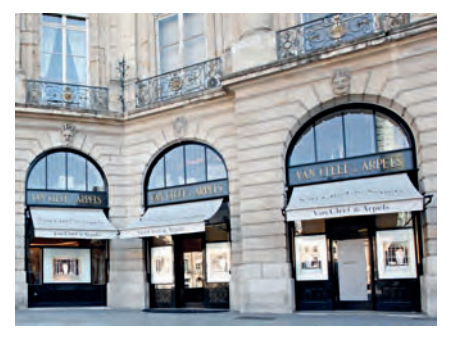
Van Cleef & Arpels on Place Vendôme, Paris

Created in 1906, Van Cleef & Arpels is a High Jewellery Maison embodying the values of creation, transmission and expertise. Each new jewellery and timepiece collection is inspired by the identity and heritage of the Maison and tells a story with a universal cultural background, a timeless meaning and which expresses a positive and poetic vision of life.