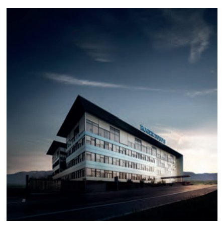
Roger Dubuis' Manufacture and headquarters, Geneva

Representing a disruptive blend of distinctive character and Haute Horlogerie expertise, Roger Dubuis has been at the forefront of the contemporary watchmaking scene since 1995. The Manufacture offers a range of audacious, hand-crafted, all-mechanical timepieces combining inventive calibres with powerful and daring designs.