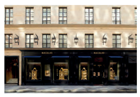
Buccellati boutique on Rue Saint-Honoré, Paris