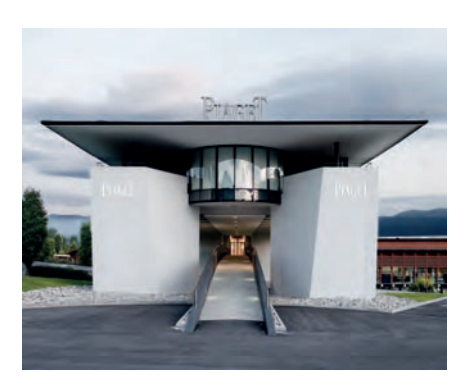
Piaget's Manufacture and headquarters, Geneva

Piaget began in 1874, with a unique vision: always push the limits of innovation to be able to liberate creativity. Positioned as a reference for precious watches and known for its audacity, it enjoys unrivalled credentials as both a watchmaker and jeweller. Two fully integrated Manufactures enable the Maison to reaffirm its unique expertise in gold and jewellery crafting as well as ultra-thin movements.