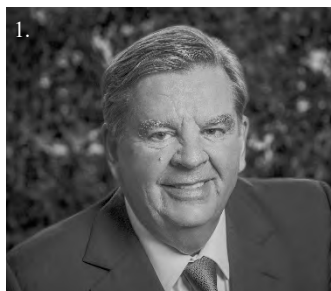
1. Johann Rupert Chairman South African, born 1950

Mr Rupert was first appointed to the Board in 1988 and served as Chairman from 2002 to 2013. Following a sabbatical year, he was reappointed Chairman in September 2014. He is Chairman of the Nominations Committee and the Senior Executive Committee.