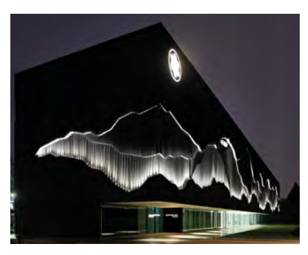
Montblanc Haus, Hamburg, Germany

For over a century, Montblanc's writing instruments have been the symbol of the art of writing. Driven by its passion for craftsmanship and creativity, Montblanc also provides elegant, sophisticated and innovative creations in the fields of fine leather and fine watchmaking.