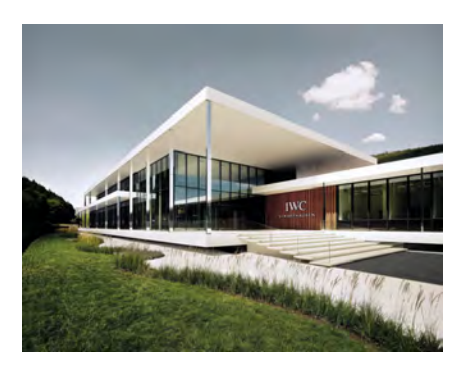
IWC Manufakturzentrum in Scaffhausen

IWC Schaffhausen is the engineer and storyteller of responsible fine watchmaking and the choice for ambitious individuals with an appreciation of mechanics, a sense of style and a taste for adventure.