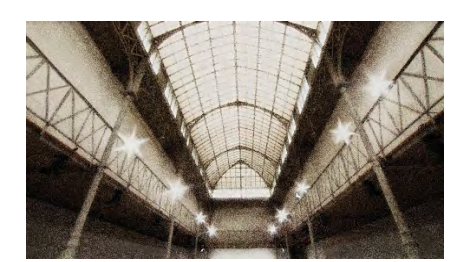
7 rue de Moussy, Paris

"My obsession is to make women beautiful. When you create with this in mind things can't go out of fashion." Azzedine Alaïa