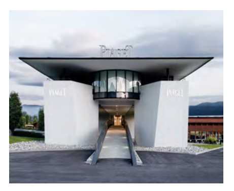
Piaget's Manufacture and headquarters, Geneva

Piaget began in 1874 with a unique vision: always push the limits of innovation to be able to liberate creativity. Newly positioned as the Maison of Extraleganza, known for its audacity, it enjoys unrivalled credentials as both a watchmaker and a jeweller. Two fully integrated Manufactures in Plan-les-Ouates and La Côte-aux-Fées enable the Maison to refine its unique expertise in gold and jewellery crafting as well as ultra-thin movements.