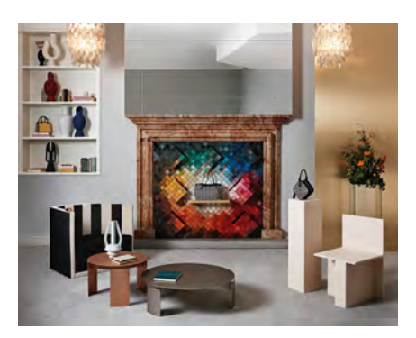
Serapian's Bespoke Salatto at Villa Mozart in the heart of Milan