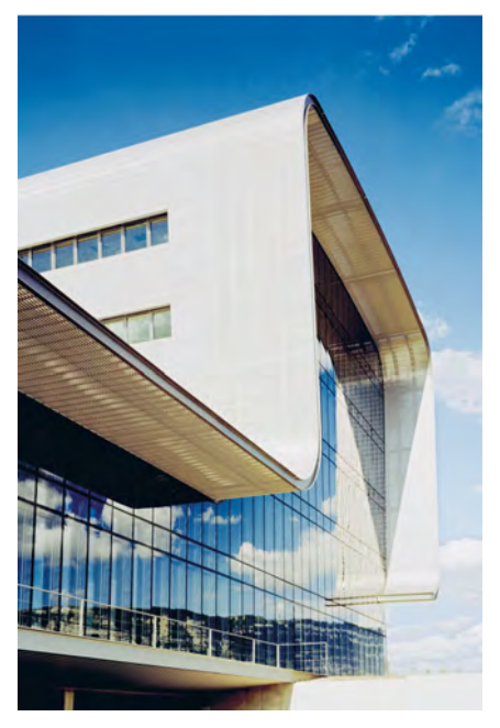
Vacheron Constantin Manufacture and headquarters, Geneva

Crafting eternity since 1755, Vacheron Constantin is the world's oldest watch Manufacture in continuous production, faithfully perpetuating a proud heritage based on transmitting expertise through generations of master craftsmen.