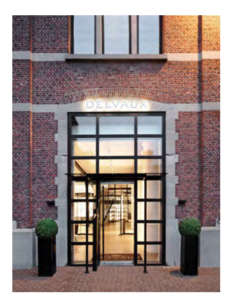
Delvaux Headquarters in Brussel's Arsenal

Founded in Brussels in 1829, Delvaux is the oldest fine leather luxury goods Maison in the world and has been active without interruption ever since with its own workshops. Delvaux is the inventor of the modern handbag having filed in 1908 the first ever leather handbag patent in the world. Since its creation, the Maison has been both avant-garde and true to the finest traditions of craftmanship while conveying the heritage and symbols of Belgian culture.