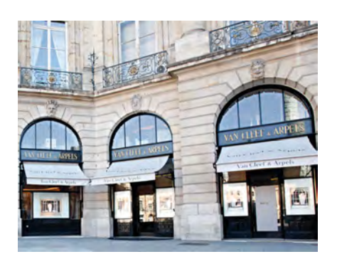
Van Cleef & Arpels on Place Vendôme, Paris

Created in 1906, Van Cleef & Arpels is a High Jewellery Maison embodying the values of creation, transmission and expertise. Each new jewellery and timepiece collection is inspired by the identity and heritage of the Maison and tells a story with a universal cultural background, a timeless meaning and which expresses a positive and poetic vision of life.