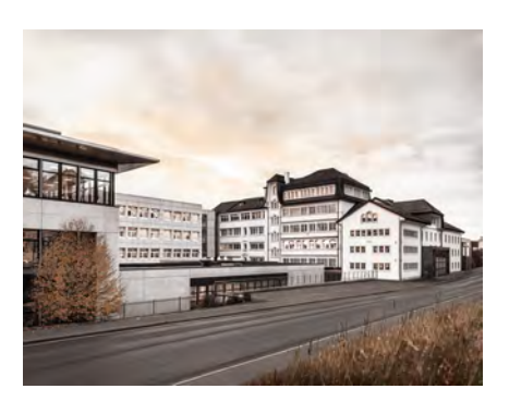
Manufacture Jaeger-LeCoultre, Le Sentier, Vallée de Joux

Since its founding in 1833, Jaeger-LeCoultre has created over 1 200 calibres and registered more than 400 patents, placing the Manufacture at the forefront of invention in fine watchmaking. Being the watchmaker of watchmakers, its leading position stems from its full integration with over 180 areas of expertise gathered under one roof, in the heart of the Vallée de Joux, Switzerland.